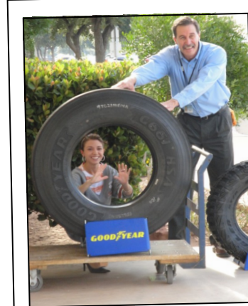
JC Penney Campaign