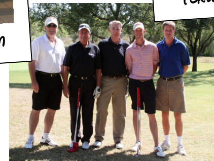
Gift of Hope Golf Classic

To see more pictures visit our Facebook page!