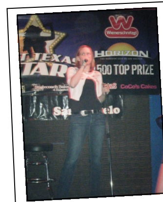
SAPD Karaoke Night