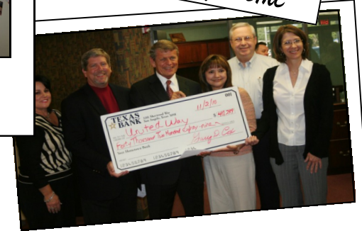
Texas Bank check presentation