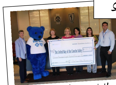
BCBS check presentation