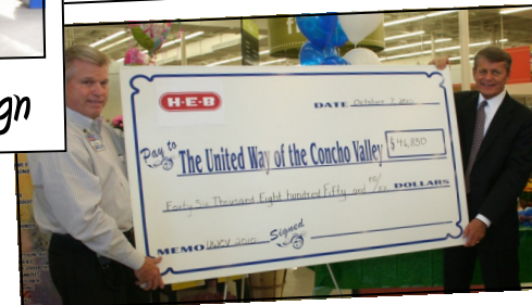
H.E.B. check presentation