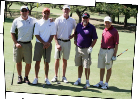
Gift of Hope Golf Classic